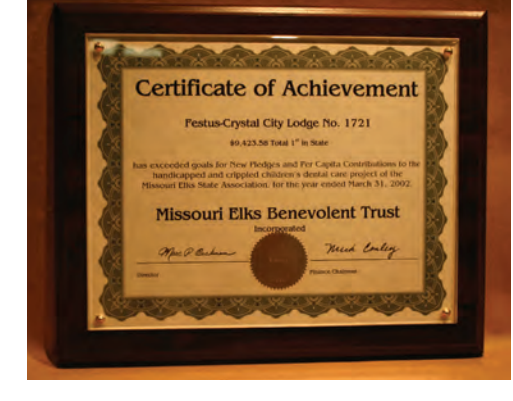
After digital remastering and like-kind certificate framing replacements.

Initial intake fire, smoke and water damage.