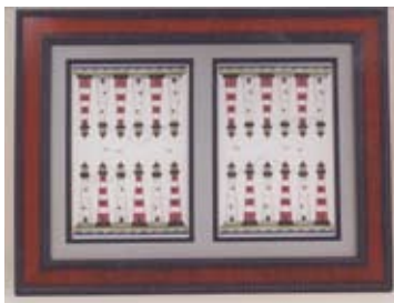
Custom Boxes and Boards