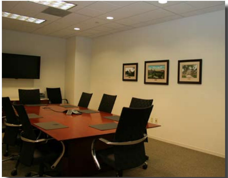
Conference Room - Law Office Saint Louis, MO