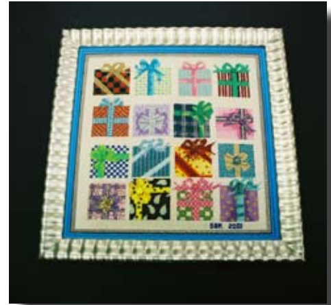
A Few Fun Examples