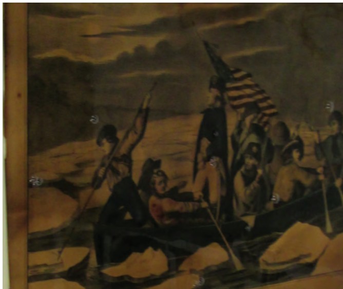
Detail Section of Print